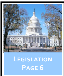
LEGISLATION PAGE 6