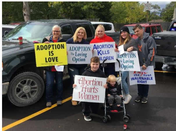
Participants pose with their signs in a parking lot.

The purpose of Life Chain is to join hearts with the Christians in our community and nation in prayer on Sunday, October 6 . Our prayer is for God’s divine mercy and intervention for our nation in order to end abortion. All participants will be silently holding prolife signs. This is an opportunity pray for life issues and the future of our nation. For more information call (810) 227-5788 or email rtlcc@sbcglobal.net .